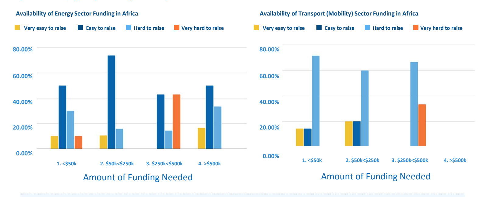
Figure 2: Availability of funding in the energy and mobility sectors